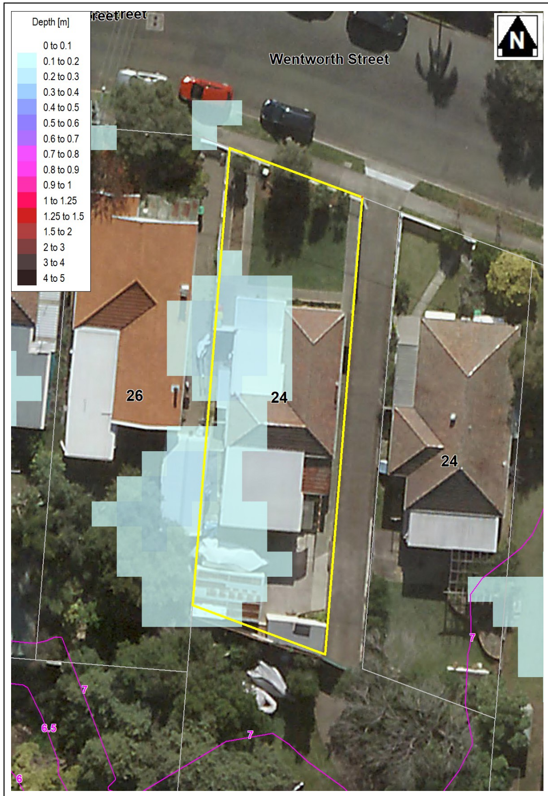
1% AEP (100 year ARI) Flood Depth