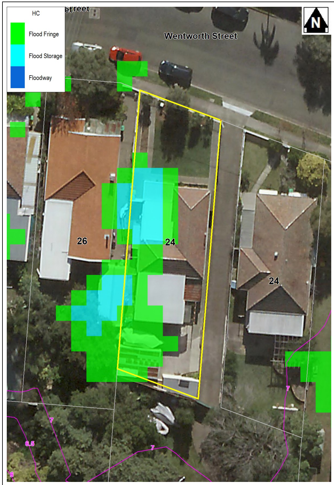
1% AEP (100 year ARI) Flood Hydraulic Category