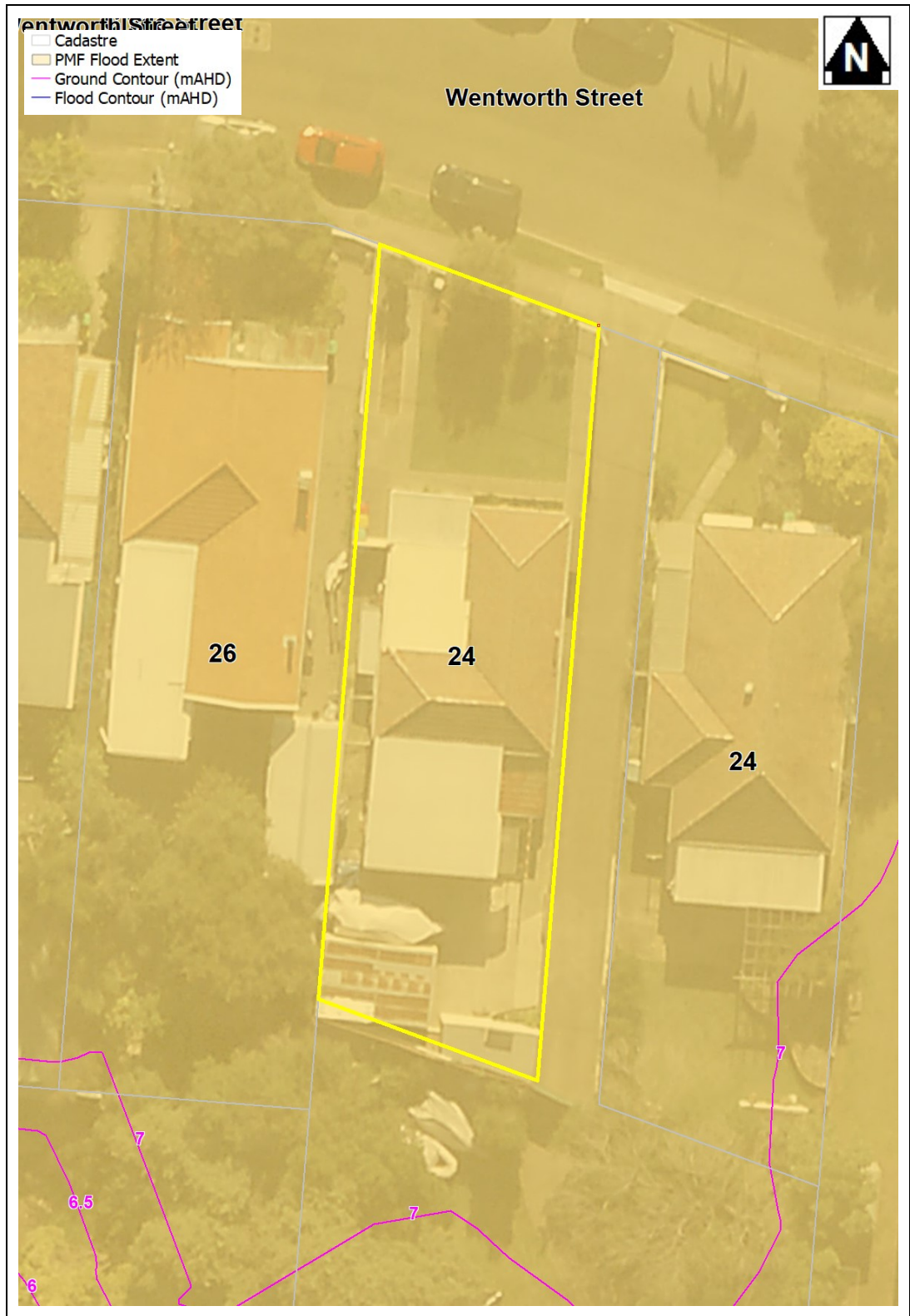
PMF Flood Extent