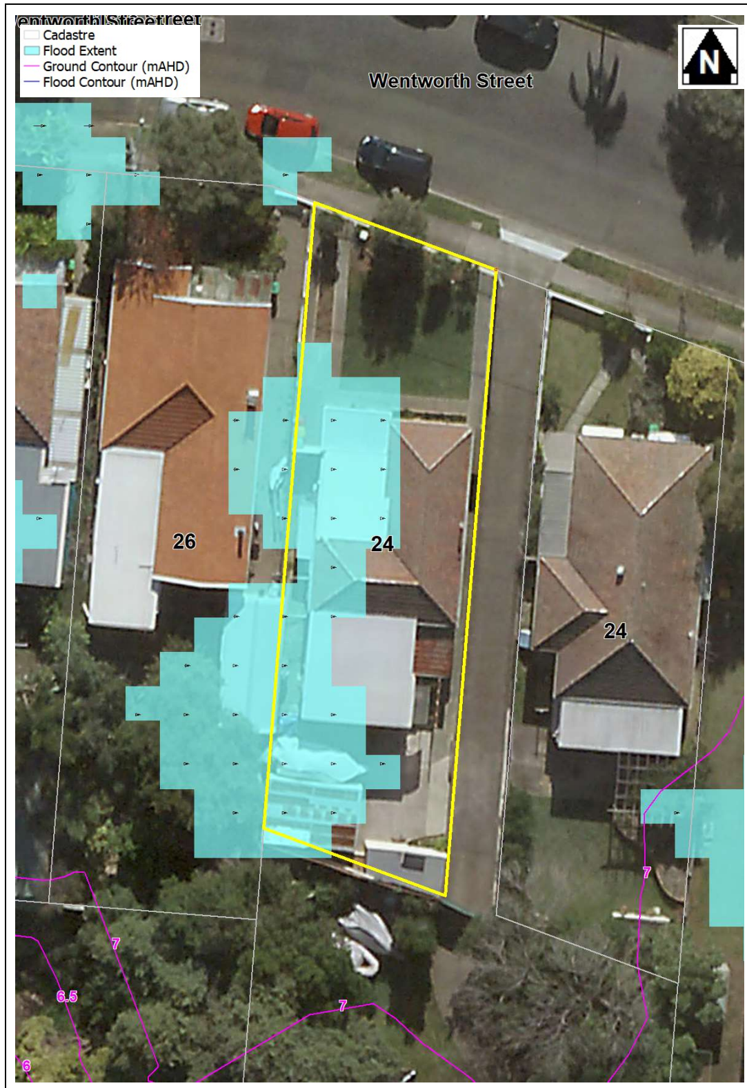
1% AEP (100 year ARI) Flood Extent