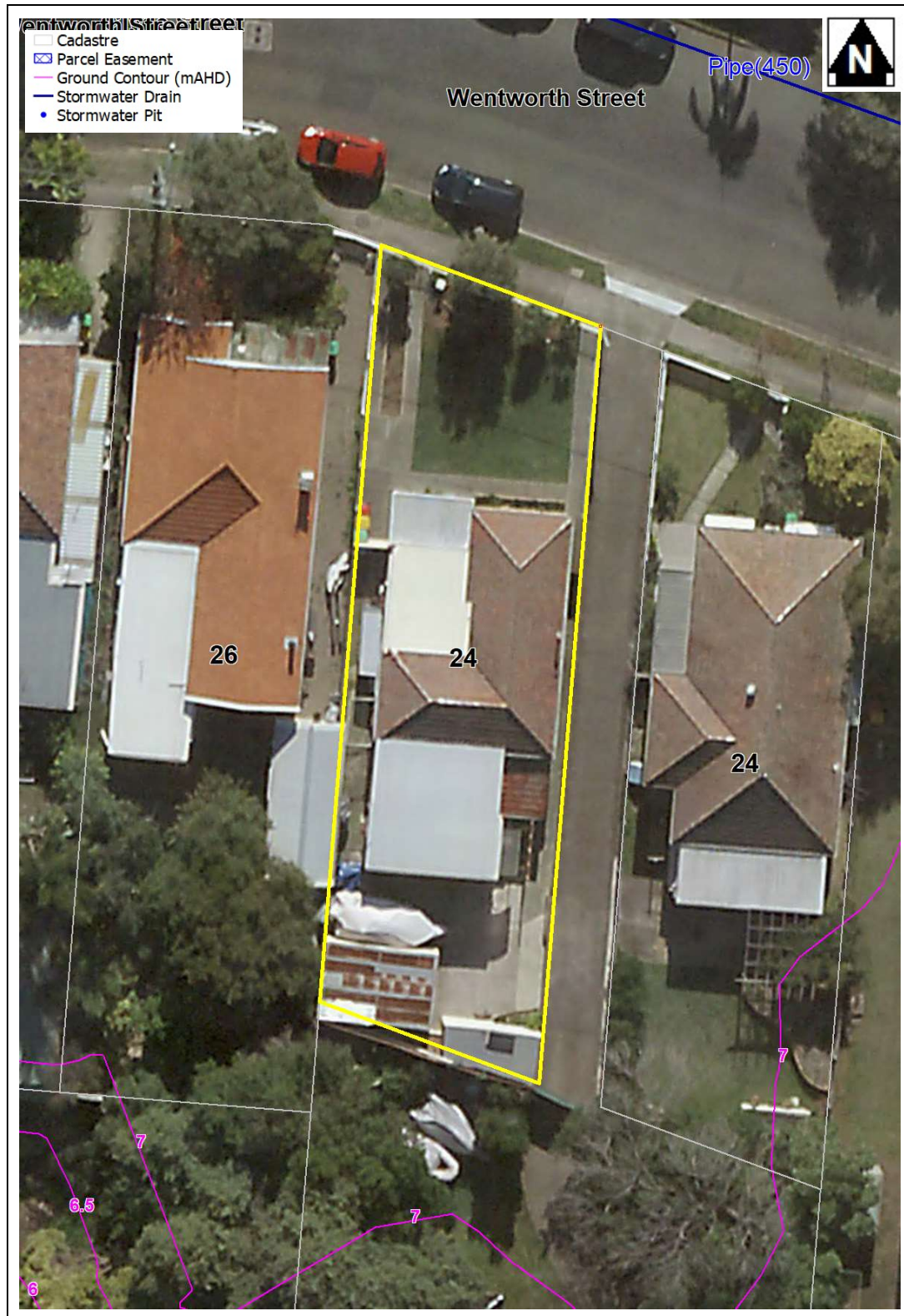
Aerial Map for 24C Wentworth Street Croydon Park 2133